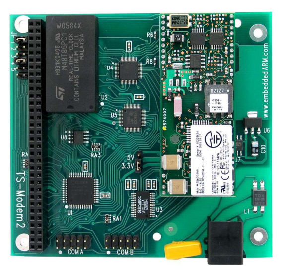
Shown with Real Time Clock, MultiTech Land Line Socket Modem and RJ11