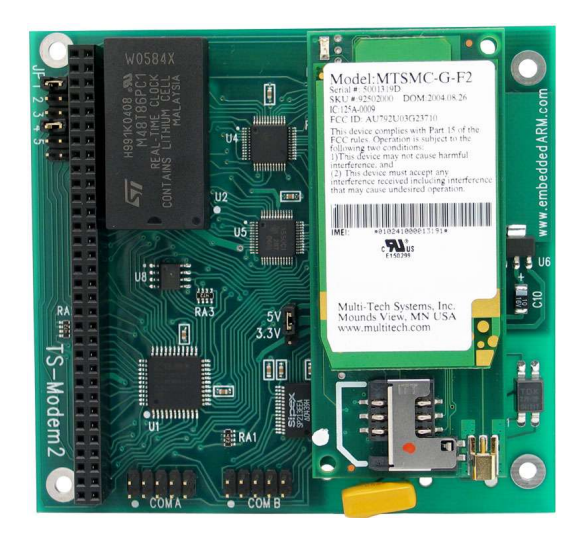
Shown with Real Time Clock and MultiTech Cellular Socket Modem