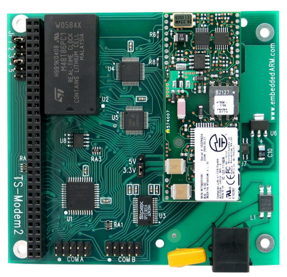
Shown with Real Time Clock, MultiTech Land Line Socket Modem and RJ11